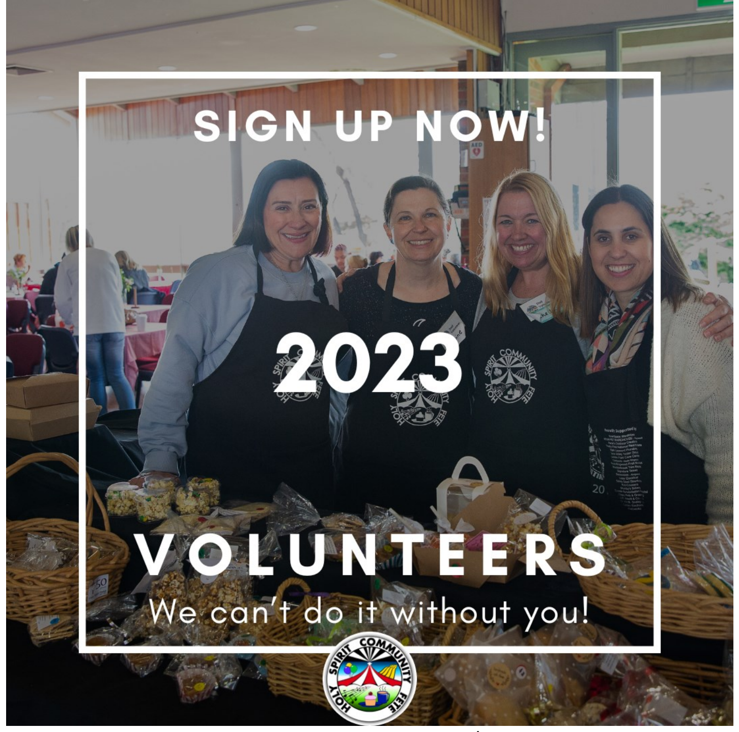
Holy Spirit Community Fete Saturday 7<sup>th</sup> October 2023.

The Committee are looking for volunteers to assist with on many stalls on fete Day. Shifts are usually 2 hours.